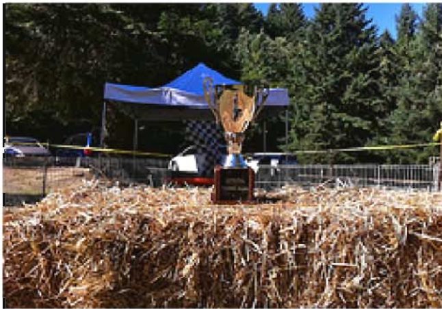
The Coveted Butane Barley Trophy

The entire collection of pictures can be viewed on the club's web site under Albums.