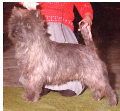
Ch Graystone's Fairborn Flame "Reggie"

For next issue, can you guess what club member has ridden horseback on almost every trail in the Wallowa Mountains? You may be very surprised!