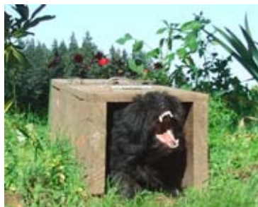
Happy in the tunnel