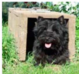
Happy in the tunnel

As most of you know my little Happy-Dog (Cairngorm Shot in the Dark) took ill at the show in Lewiston, Idaho at the end of April. He spent 2 weeks going from Frontier Vet, intensive care at Dove Lewis and Emergency Vet of Tualatin while Vets from all over the west coast tried to determine what was wrong. Unfortunately the cause was never exactly diagnosed, it is assumed he ingested something.