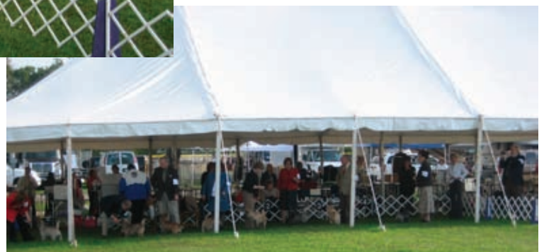
Conformation at Montgomery