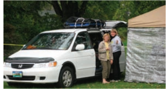
Agility at Kimberton