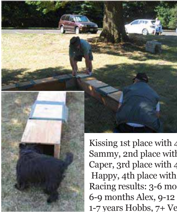
Kissing 1st place with 45 kisses Sammy, 2nd place with 17 kisses Caper, 3rd place with 4 kisses Happy, 4th place with 1 kiss Heidi. Racing results: 3-6 months Jackson, 6-9 months Alex, 9-12 months Bently, 1-7 years Hobbs, 7+ Veterans Caper!